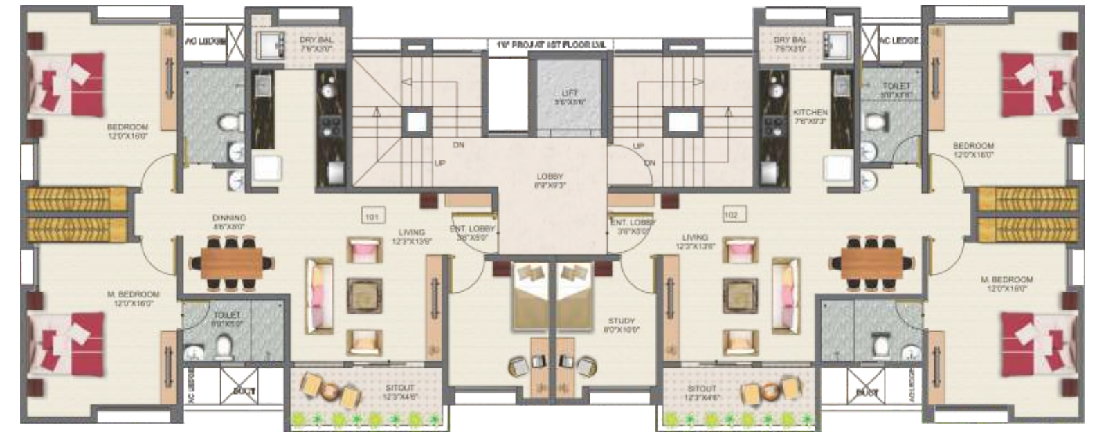
TYPICAL 1ST, 2ND, 3RD & 4TH FLOOR PLAN