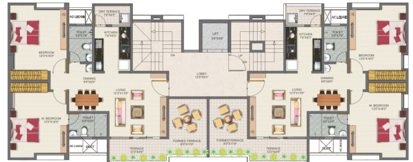
5TH FLOOR PLAN